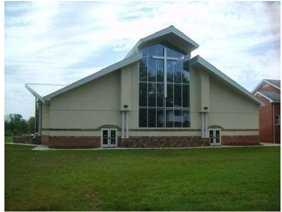
Recreation Outreach Center (ROC); groundbreaking in 2006, dedicated in 2011

At Redland you'll find some people who are lifelong Baptists, as well as many from other church backgrounds or who have had little previous experience with Christianity. All are welcome here!