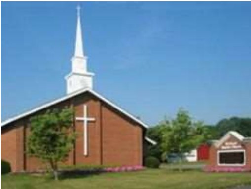
Expanded Campus, 2011