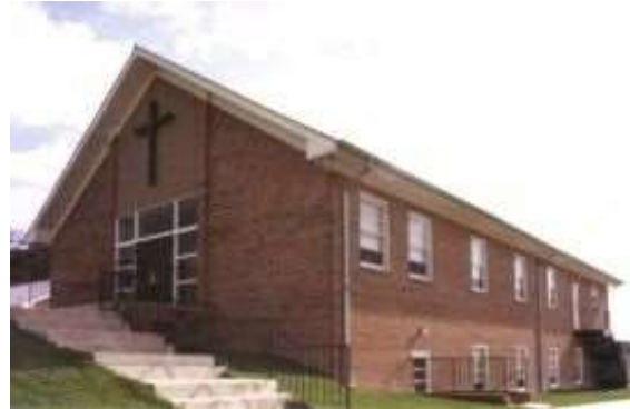
Original Chapel Building; groundbreaking in 1969, dedicated in 1970

In 2016, Redland Baptist Church celebrated 50 years of active service in the Derwood area of Montgomery County, MD, a suburb of Washington, DC.